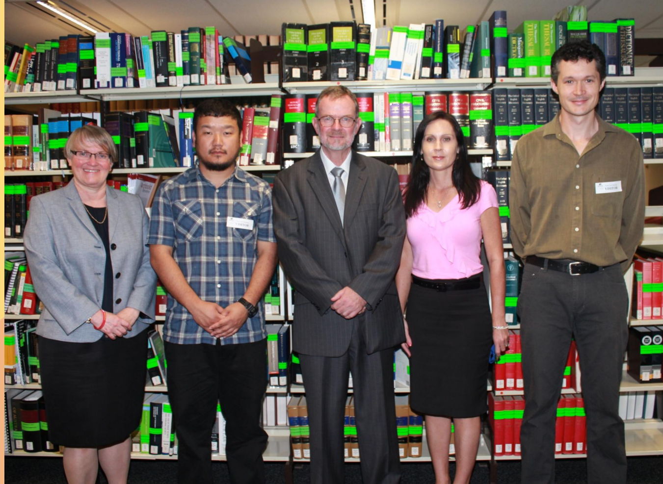
Crown Law Library