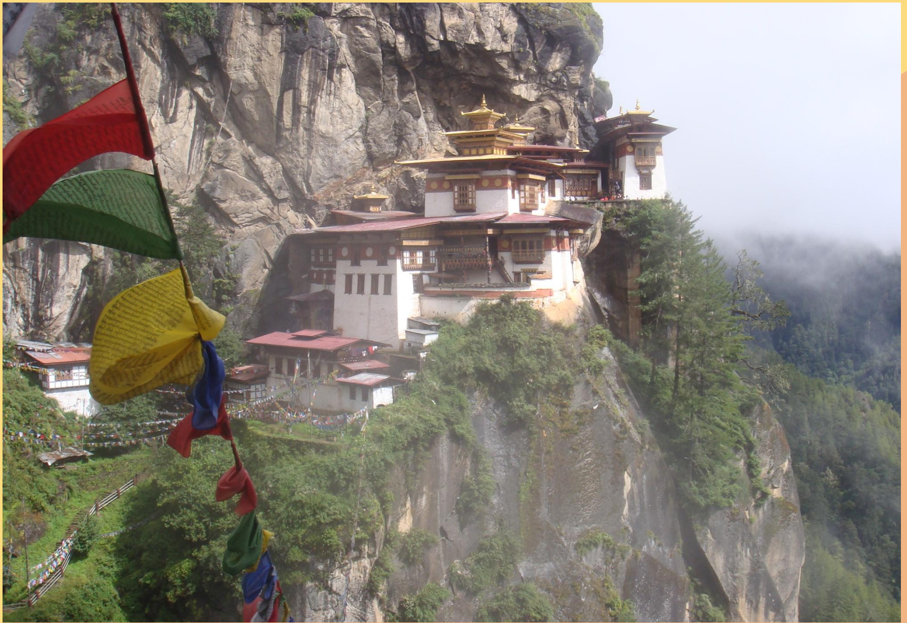
Hike to Taktsang Monastery - The Tiger's Nest